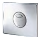
38 862 Skate 000, P00, SH0 (vertical or horizontal installation)