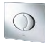
38 506 Skate Air 000, P00, SH0 (for horizontal installation only)