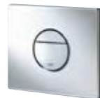
38 765 Nova Cosmopolitan 000, P00, SH0 (vertical or horizontal installation)