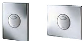
38 862 Skate 000, P00, SH0 (vertical or horizontal installation)