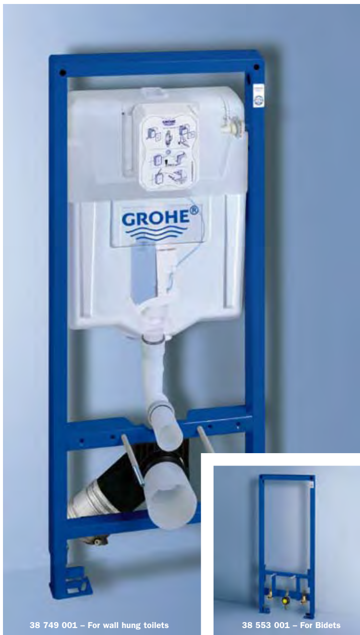
38 749 001 – For wall hung toilets

Simple and quick installation for professionals