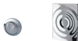
38 771 000 Eau2 Dual Flush Air Button (for remote actuation) 43 553 000 Surf Cover Plate (for use with 38 771)