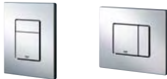
38 732 Skate Cosmopolitan 000, P00, SH0 (vertical or horizontal installation) SD0 (vertical installation only)