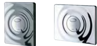
38 861 Surf 000, P00, SH0 (vertical or horizontal installation)