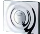
38 861 Surf 000, P00, SH0 (vertical or horizontal installation)