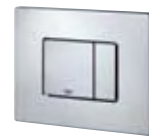
38 776 SD0 Skate Cosmopolitan (for horizontal installation only)