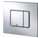
38 732 Skate Cosmopolitan 000, P00, SH0 (vertical or horizontal installation) SD0 (vertical installation only)