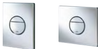
38 765 Nova Cosmopolitan 000, P00, SH0 (vertical or horizontal installation)